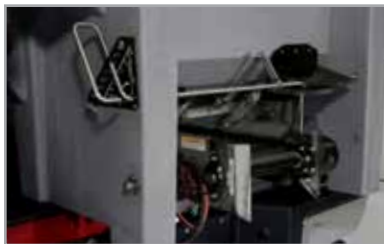
METER MATERIAL FLOW WITH THE ADJUSTABLE FEED GATE.