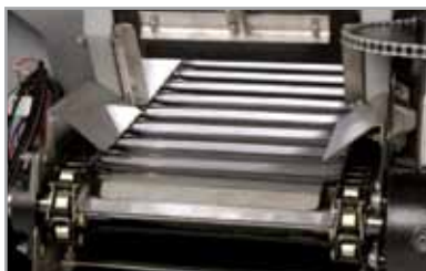
STEEL PINTLE CHAIN CONVEYOR and corrosion-resistant stainless steel housing combine proven design with industry-leading performance.